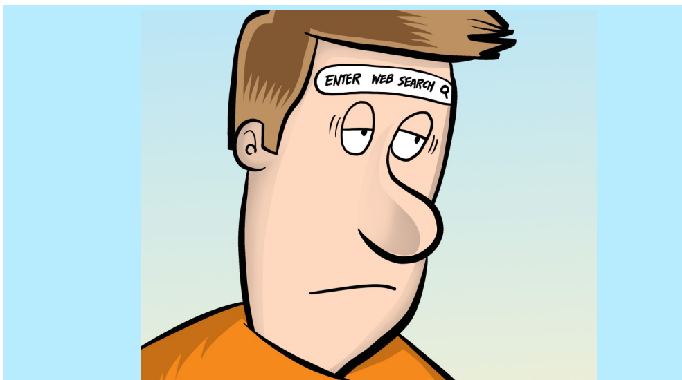
Larry Grew A Unibrowser.

Craft A Story. Tell your story and open up to customers. Stories define who we are, and they can define your business's personality. Forbes, Jan. 27, 2021