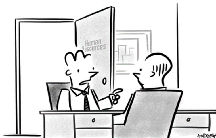
"But I think we can both agree that my nap ethic is fantastic."

Identify Stress "Weaknesses" – When stressed, identify what it is about a situation or task that is causing you stress. Then, focus on that cause and determine what you can do to mitigate it. It might mean reorganizing your day, such as reading and responding to e-mails at a different time. Or maybe you need more information on the issue you're dealing with, so do some research and see what you can find to help. Inc., July 8, 2020